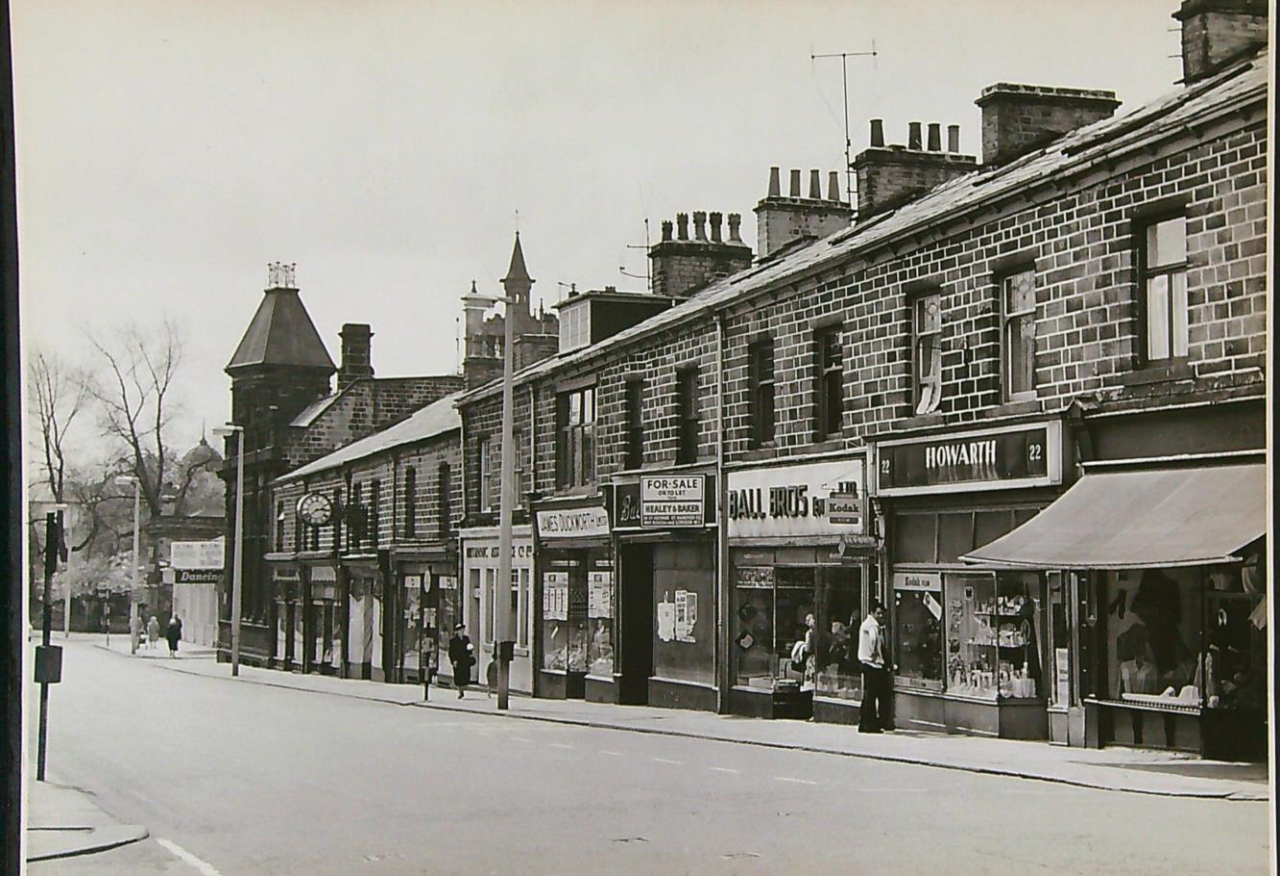
Clock on Bank Street